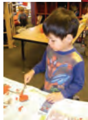
Nursery school artists hard at work, having fun creating art.