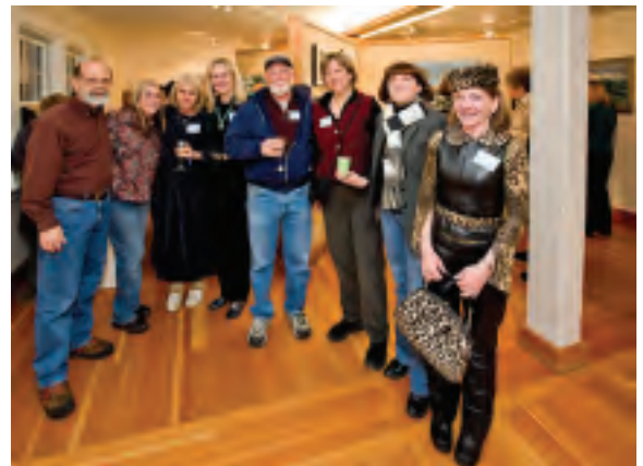
A gathering of First Friday artists and attendees

8:30 am to 5 pm Mon-Fri - 10 am to 5 pm Saturday