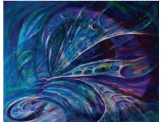
Connecting Heaven on Earth, mixed media on canvas by Yasmin Sayyed

Yasmin describes art as a language of the heart, fusing intellect and sacredness in a single brush stroke and in a single intention of standing in union with nature and cosmic rhythms. As an artist she feels compelled by an inner calling of spirit and character to examine her realities with a heart set to amplify what heals the struggles and delights the soul. Her work is about art as an expression of individual and collective consciousness and how Spirit courses through her to give