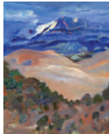
Plein Air painting by Bunny Carnahan

Bunny's work is colorful and full of uplifting images. They'll make you feel like dancing through the gallery.