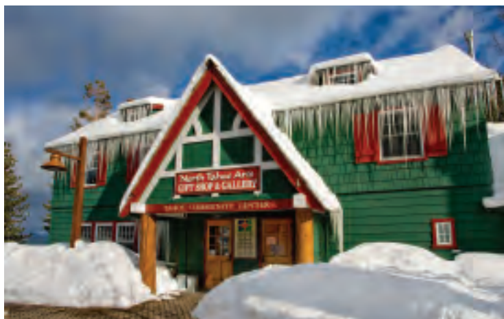
Your Art Center needs you!